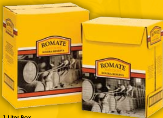
1 Liter Box