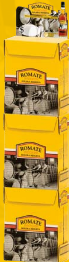
Case Card with display